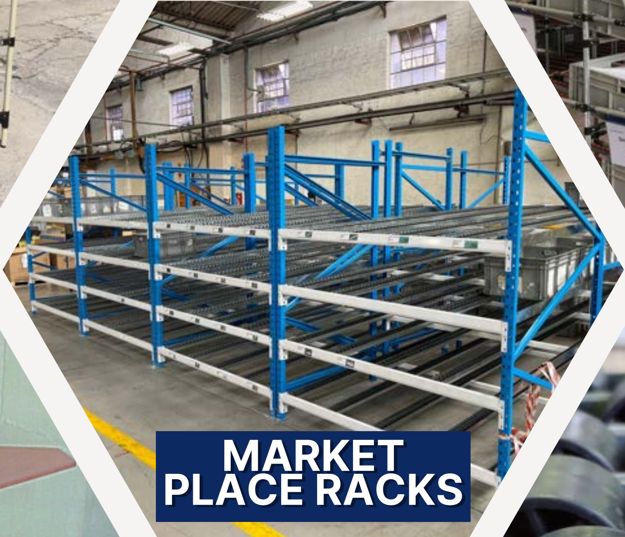
MARKET PLACE RACKS