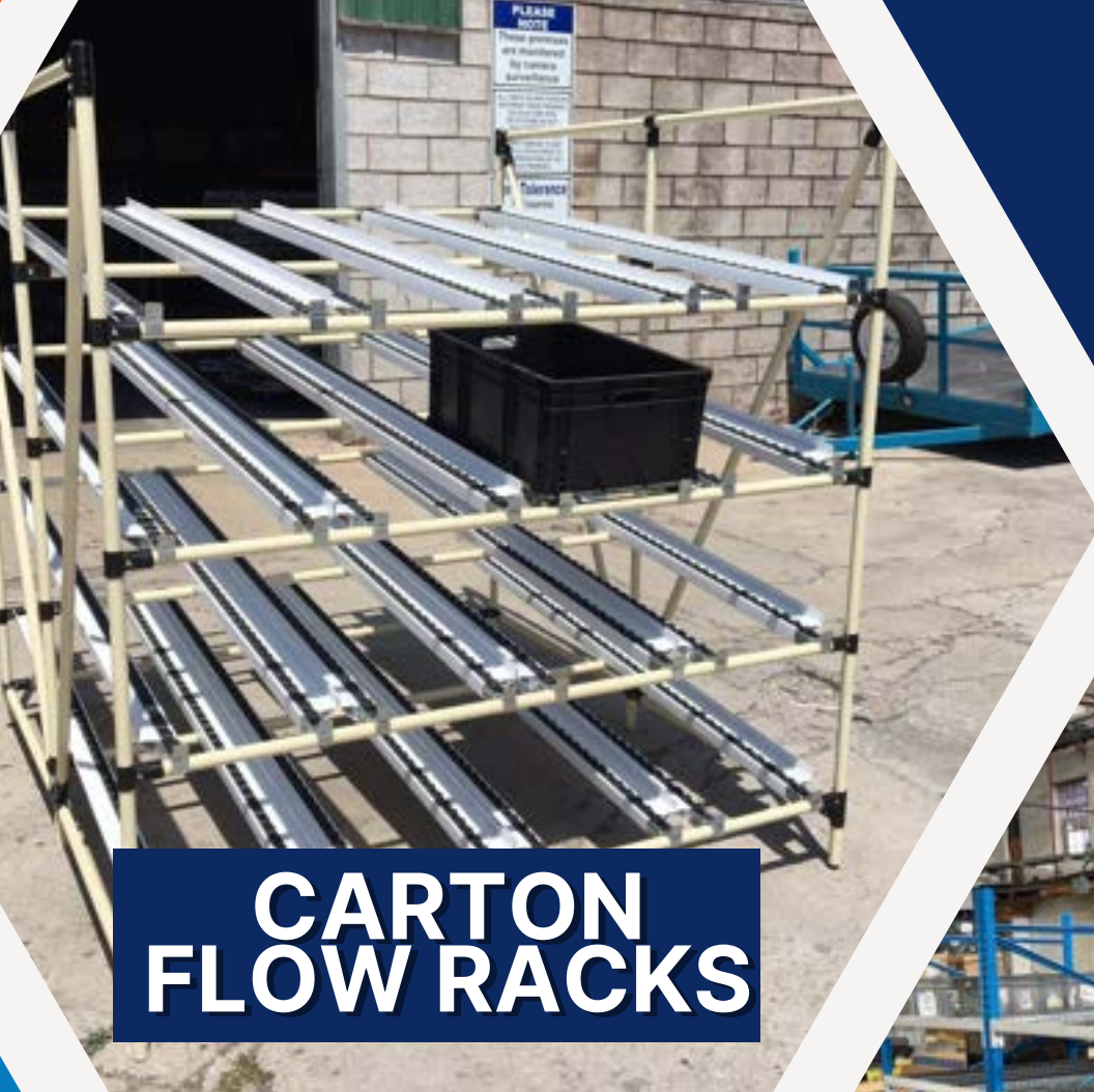
CARTON FLOW RACKS