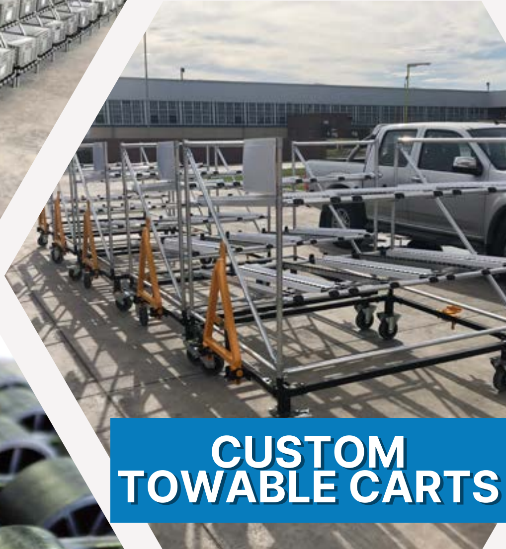
CUSTOM TOWABLE CARTS